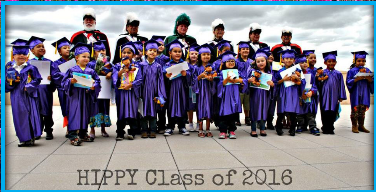
HIPPY Class of 2016